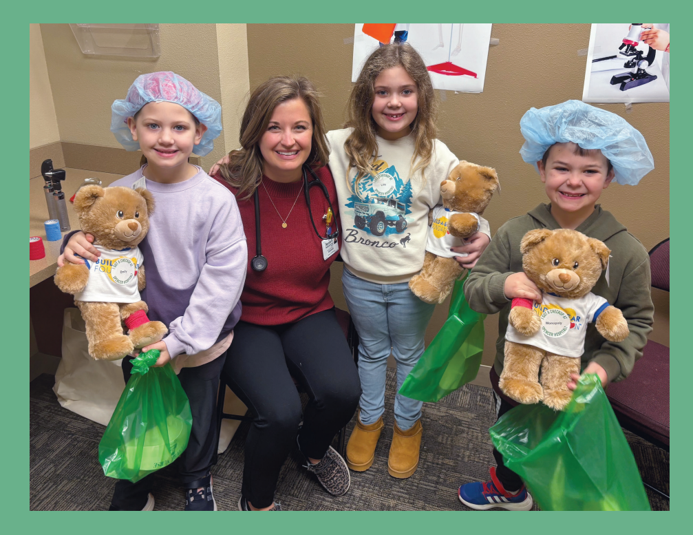
From there, students broke into small groups and rotated through several interactive stations throughout the hospital.

The Teddy Bear Clinic was designed with intention and care, offering young students a first glimpse into the world of healthcare in a nonthreatening, joyful environment. Upon arrival, students were greeted with high-fives from a life-sized teddy bear, immediately setting a playful and welcoming tone for the day.