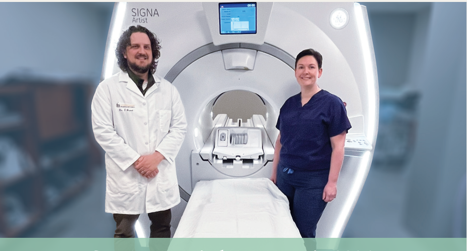
Spencer Hospital Fast Facts in 2024