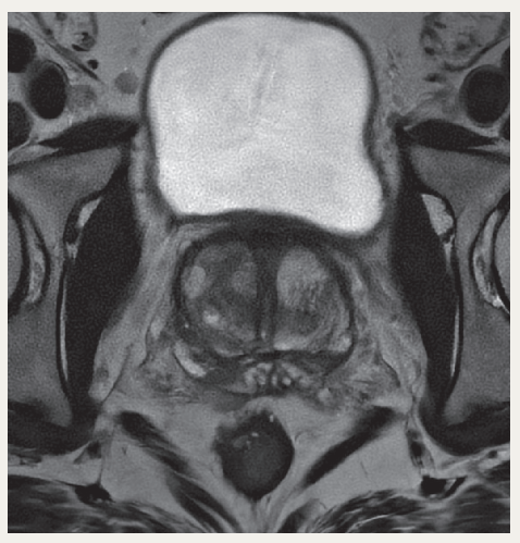
Above: MRI imaging of a prostate

By investing in the most advanced technology and building a team of highly trained specialists, Spencer Hospital continues to raise the standard of care in rural healthcare. The integration of prostate MRI, fusion-guided biopsy, and comprehensive treatment at the Abben Cancer Center means patients receive comprehensive diagnosis and care — close to where they call home.